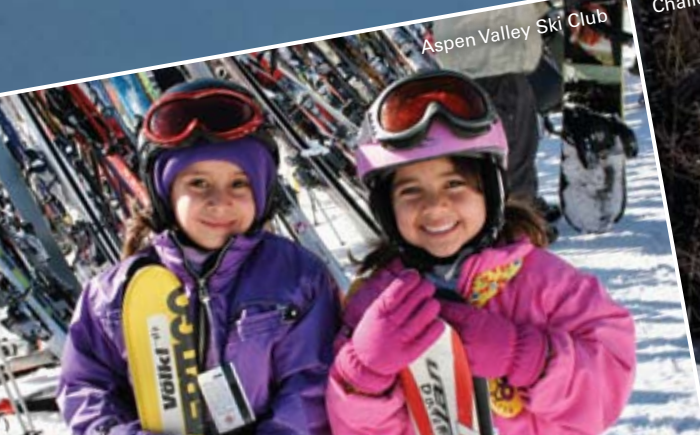
Aspen Valley Ski Club