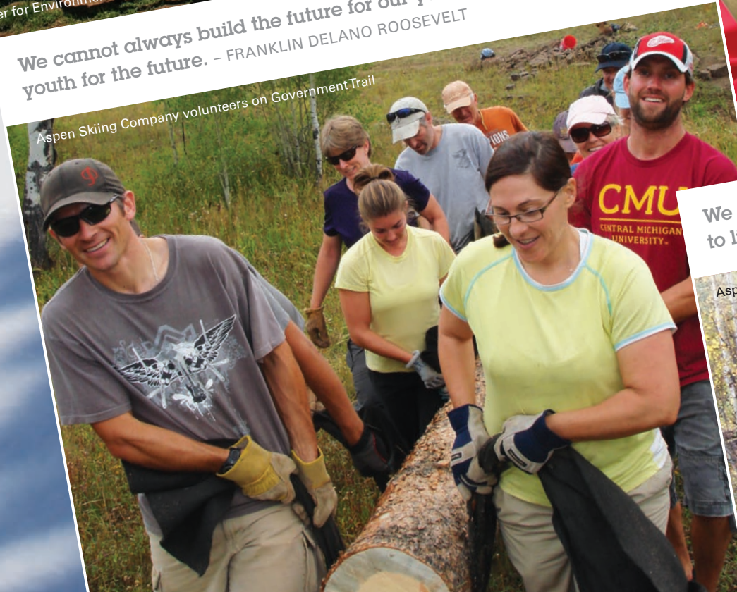
Aspen Skiing Company volunteers on Government Trail

We cannot always build the future for our youth, but we can build our youth for the future. – FRANKLIN DELANO ROOSEVELT