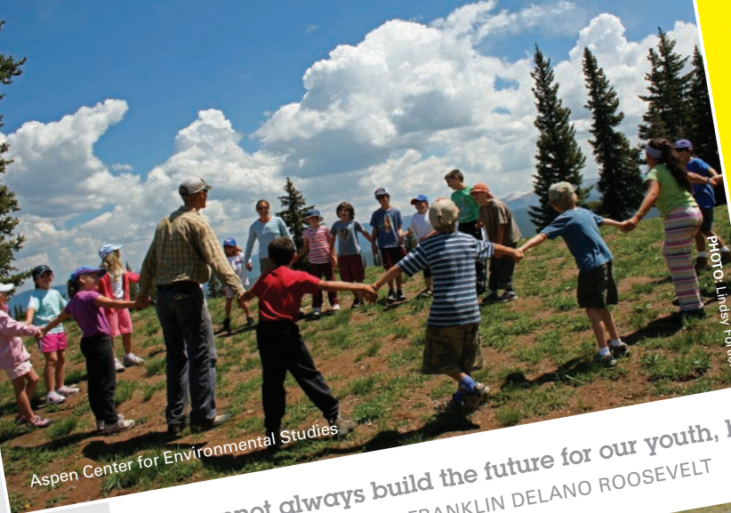
Aspen Center for Environmental Studies