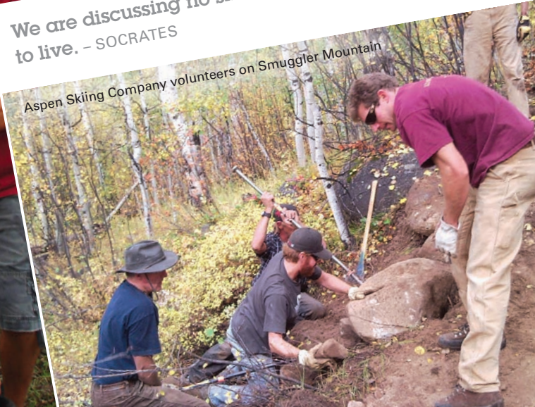
Aspen Skiing Company volunteers on Smuggler Mountain

We are discussing no small matter, but how we ought to live. – SOCRATES