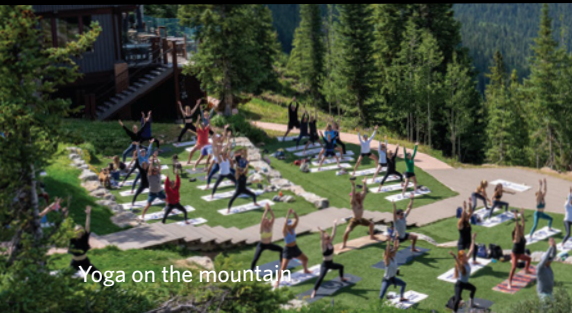
Yoga on the mountain

For updates, visit: aspensnowmass.com/summer .