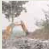
Aspen Skiing Company deconstructed and recycled the Sundeck Restaurant and the Snowmass Club, keeping 85% of the buildings out of the landfill and cutting disposal costs.